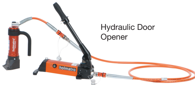
Hydraulic Door Opener