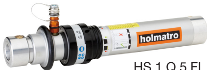
HS 1 Q 5 FL