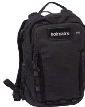
GBP10 EVO3 - BACKPACK PUMP