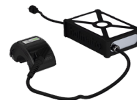
Mains Power Connector (US) (115 VAC)