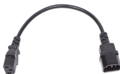
Daisy Chain Power Cord