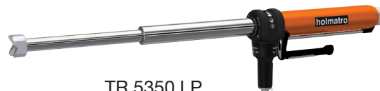
TR 5350 LP