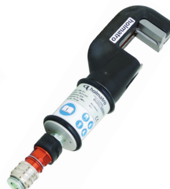
HMC 8 U