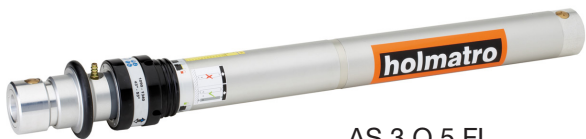
AS 3 Q 5 FL