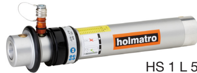
HS 1 L 5 +