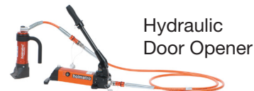
Hydraulic Door Opener