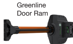
Greenline Door Ram