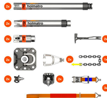
BASIC VEHICLE &amp; STRUCTURAL SHORING – PNEUMATIC SET VS-PS1