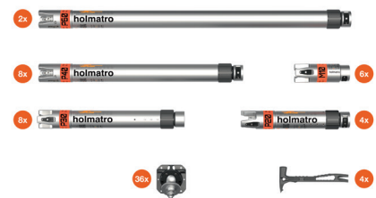
ADVANCED TRENCH SHORING – PNEUMATIC SET AT-PS1