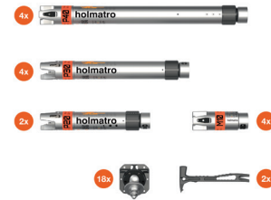
BASIC TRENCH SHORING – PNEUMATIC SET T-PS1