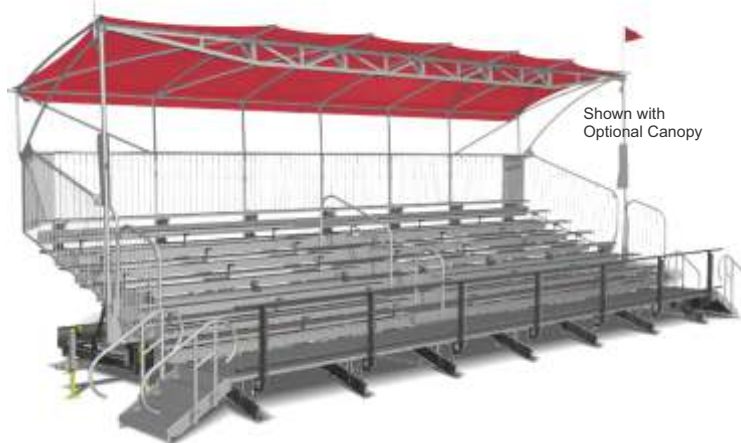
Shown with Optional Canopy

Offer increased visibility and improved spectator sightlines with elevated 7-row mobile bleachers. Elevated seating allows spectators to watch events free of interference from obstructions or walking spectators.