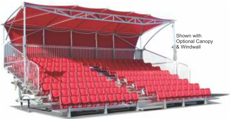
Shown with Optional Canopy & Windwall

For events where spectator comfort is a priority, the TSPVIP series of mobile grandstands delivers. TSPVIP grandstands feature molded, individual seats with seat backs and spring-loaded seat bottoms that do not collect water. A unique folding mechanism allows all seat rows to remain permanently attached to the grandstand structure for fast, easy set up. Towing tongue retracts for spectator safety while also allowing end-to-end placement of multiple units.