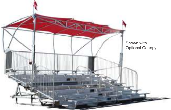
Shown with Optional Canopy

Reduced towing weight and increased maneuverability make these eight-row bleachers ideal for use on sports fields and other soft-surface applications. Multiple frame-mounted leveling-support jacks distribute seating loads over a wide area. Aluminum seat and footboards offer a high degree of weather resistance, promoting year-round use. A retractable towing tongue reduces the overall length when set up, while eliminating a tripping hazard.